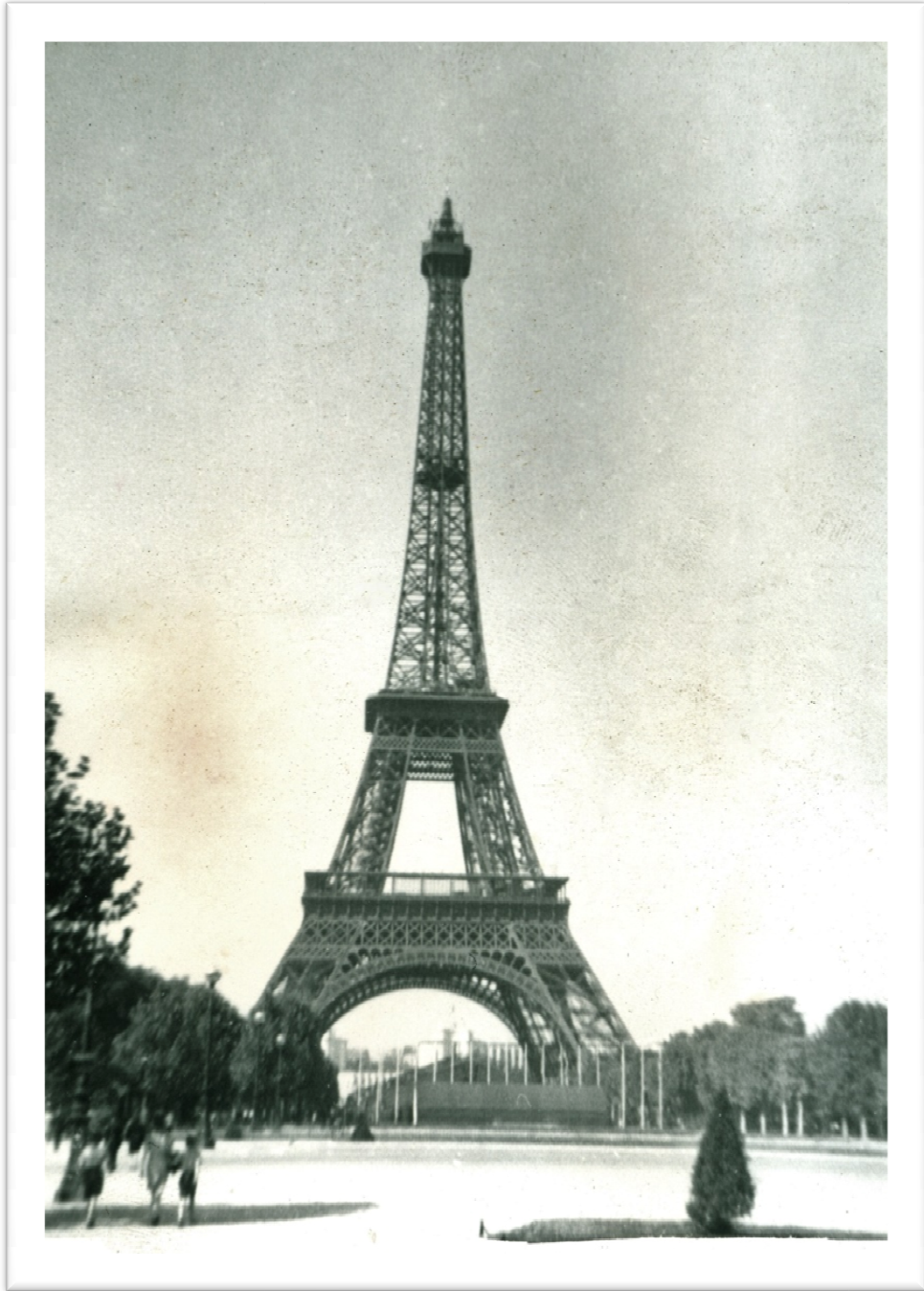
The Eiffel Tower, August 1945