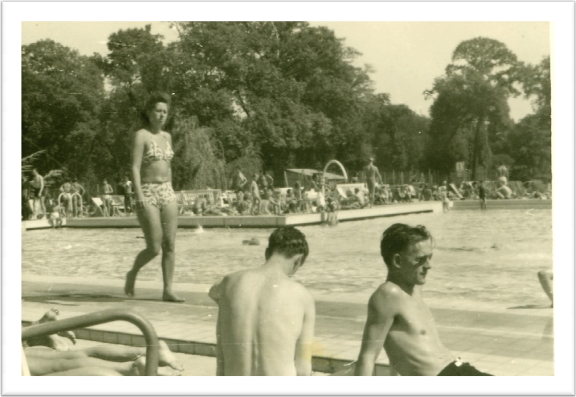
The famous bikini was invented by the French.