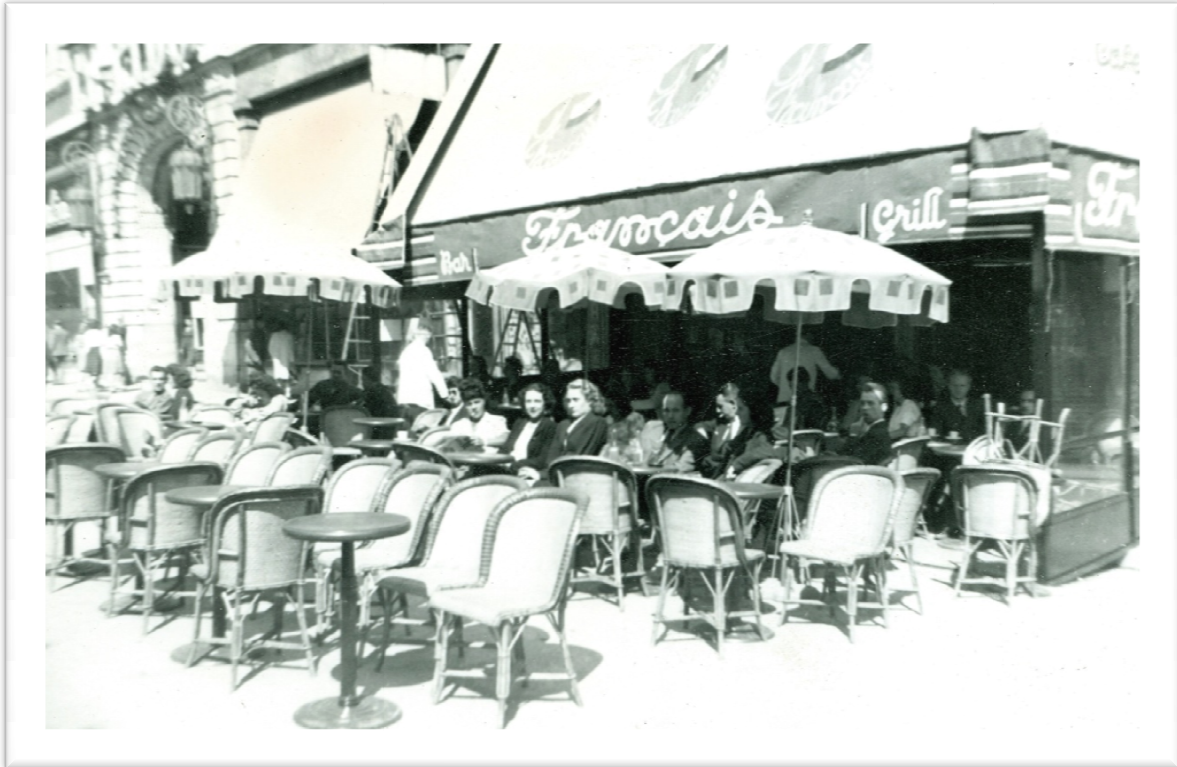
Where the Germans had been drinking in 1944.